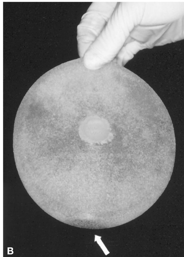
(A) Upright chest radiograph showing displacement of the expander infusion ports. (B) The infusion ports were found to be free floating within the intact elastomer shell. The arrow indicates the metallic port.