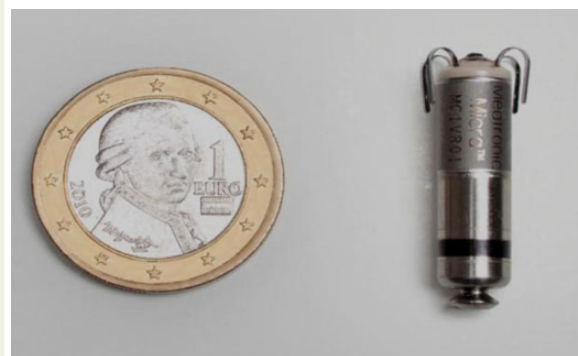
Figure 2 The Medtronic Micra™ Transcatheter Pacing System.

The primary fixation mechanism of the LCP device is a screw-in helix with a maximum penetration depth in tissue of 1.3 mm. Three nylon tines provide a secondary fixation mechanism by avoiding